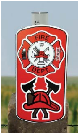
3" x 6" Plastic Rain Gauge 5" plastic tube # 11129