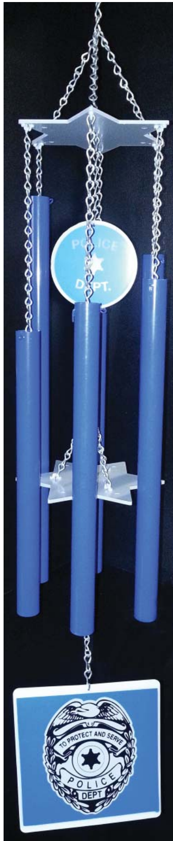
Wind chime 34" tall # 55597