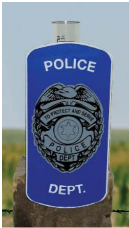
3" x 6" Plastic Rain Gauge 5" plastic tube # 11130