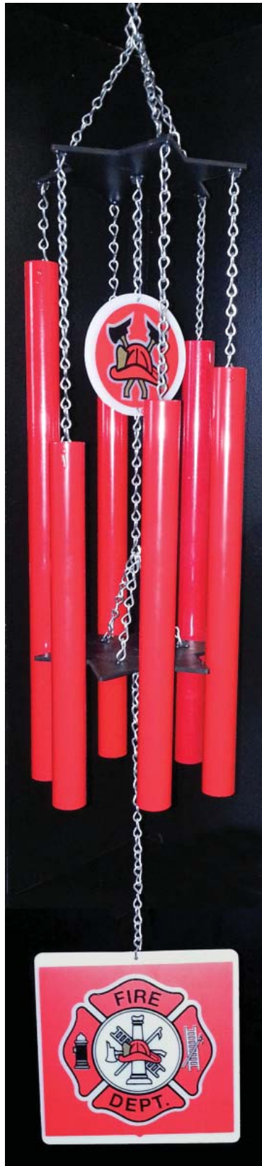
Wind Chime 34" tall # 55596