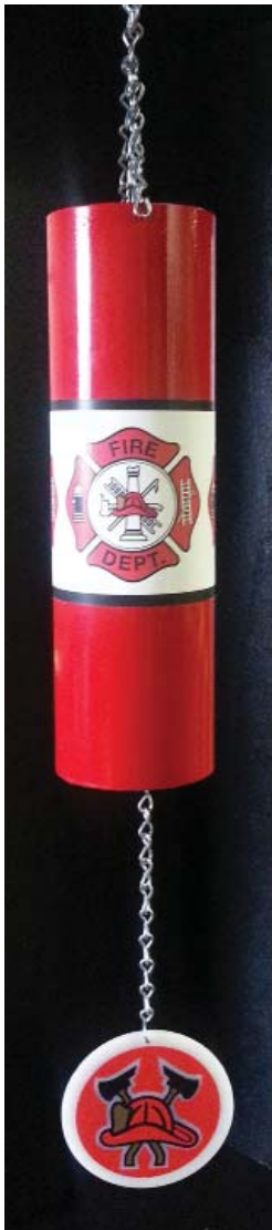
Wind Bell 3" x 10" Metal tube 25" tall # 54104