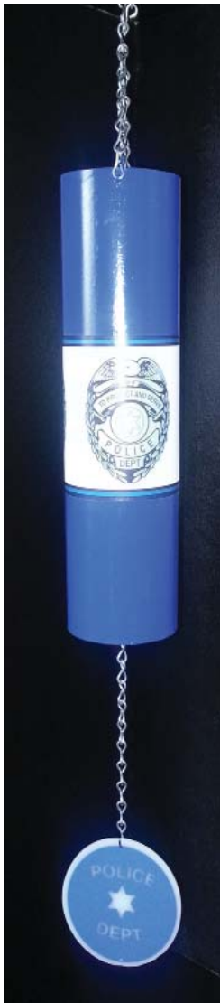
Wind Bell 3" x 10" Metal tube 25" tall # 54105