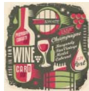
Premium Wine 54134