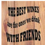
Wine & Friends 54118