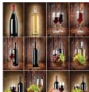
Wine Collage 54129