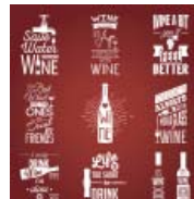
Wine Sayings 54135